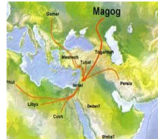
Countries that will join Gog in attacking Israel