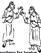
Prophecy for twelve hundred and sixty days, clothed in sackcloth

Nevertheless, the LORD will select 144,000 Jews, 12,000 from each original tribe and place a seal of protection on them. They will belong to Him and no one can harm them.