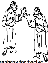
Prophesy for twelve hundred and sixty days, clothed in sackcloth

The past three and one-half years have been difficult for the nation of Israel here on earth with no food, no rain, and no help from the surrounding countries. Israel's trouble has been brought about by the two witnesses who have been pointing people to the LORD, calling for a solemn assembly of the entire nation before the LORD, but the nation has rejected their message and hated the two men.